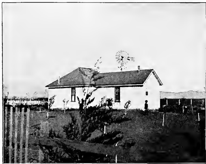
COLONIST'S HOUSE, FORT ROMIE.